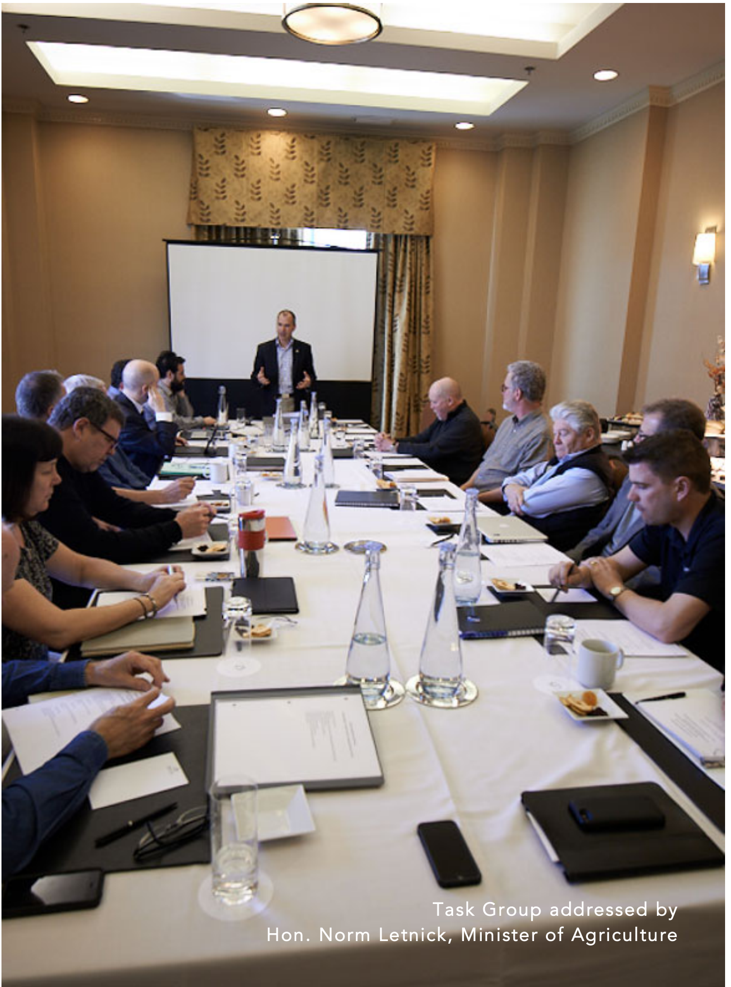
Task Group addressed by Hon. Norm Letnick, Minister of Agriculture